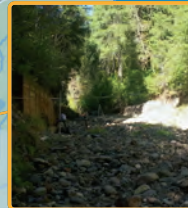
After removal, West Panther Creek

Increased minimum flows in all affected Mokelumne watershed reaches, including spring pulses, whitewater recreational flows, and a prohibition on extreme power-related releases.